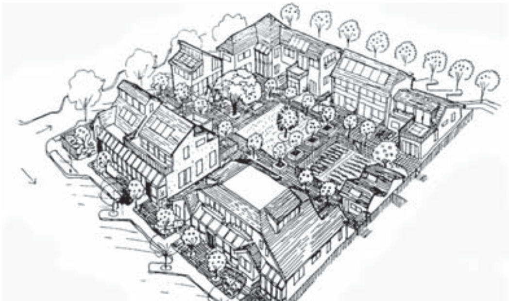
Urban Cooperative Block graphic by the Shared Living Resource Center 2337 Parker Street #9, Berkeley, CA 94704-2841 (510) 548-6608 slrcnorwood@earthlink.net

The concept of natural law itself offers a potential spiritual focus in its expression of a belief in a source of knowledge, love and grace beyond the individual, which all may affirm, provides a context within which to build human community.